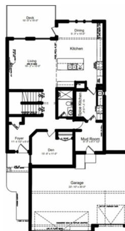
Main Floor Plan