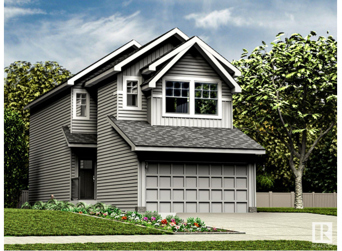
The Archer 20 | 1,585 Sq. Ft.

MLS® # E4444264 Price $539,250 Bedrooms 3